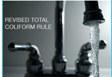
The 'Revised Total Coliform Rule' went into effect during 2016 to help protect public health.