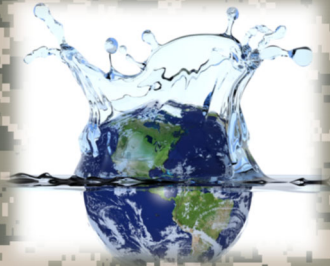
Most constituents of drinking water are naturally occurring throughout the environment.