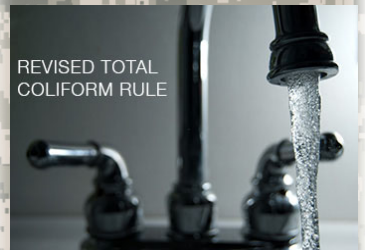
The 'Revised Total Coliform Rule' went into effect during 2016 to help protect public health.

More information and general guidelines on ways to lessen the risk of infection by microbes are available from the EPA's Safe Drinking Water Hotline at 1(800) 426-4791 or at https://www.epa.gov/ground-water-and-drinking-water .